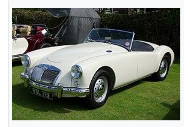
1956 MGA 1500