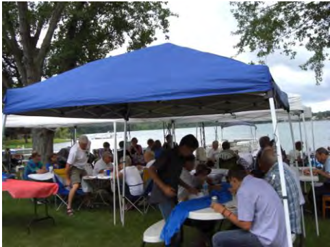
Everyone enjoying the good food!